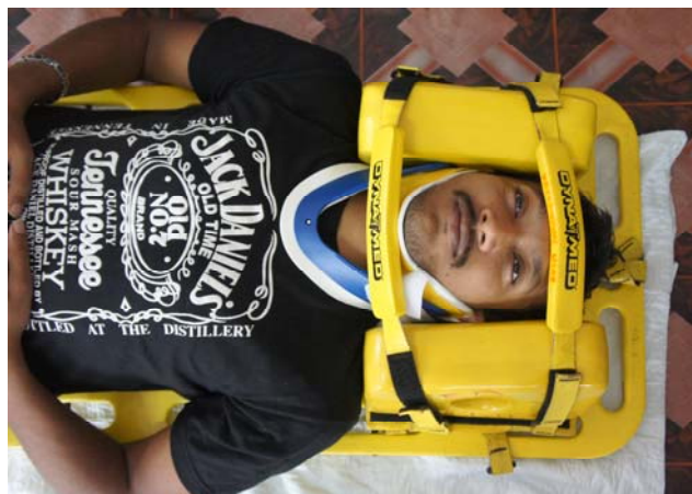
Figure 3: Cervical collar and head immobilizer in place

Devices such as cervical collar and head immobilizer (consisting of head blocks and straps) should be placed on patient prior to patient movement ( Figure 3 ). If no collar can be made to fit patient, towel or blanket rolls may be used to support neutral head alignment. The head must be supported at all times prior to exclusion of C-spine injuries, hence prior to use of collar and immobilisers or if they are removed at any point (e.g., when log-rolling to perform a full examination), neutral alignment must be maintained manually with a hand placed on either side of the patient's head. Use rigid spinal boards during patient transfer to prevent unstable fractures causing further neurological deficits.