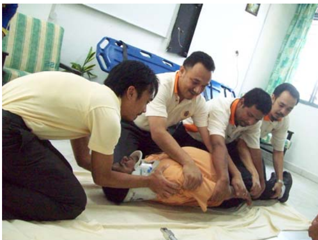
Figure 4: The log roll

Finally, log roll the patient using spinal immobilization technique to palpate the spine for step-offs or tenderness ( Figure 4 ). To perform the "log roll", at least 5 people are required - three are to manoeuvre the body, one to position the head and lastly one to examine. Steps on performing the log roll are as follow 2 :