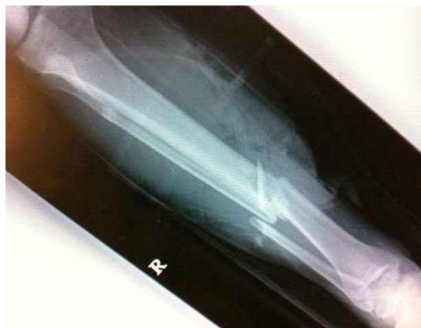
Figure 9: An AP view of a distal comminuted tibia/fibula fracture with butterfly fragment