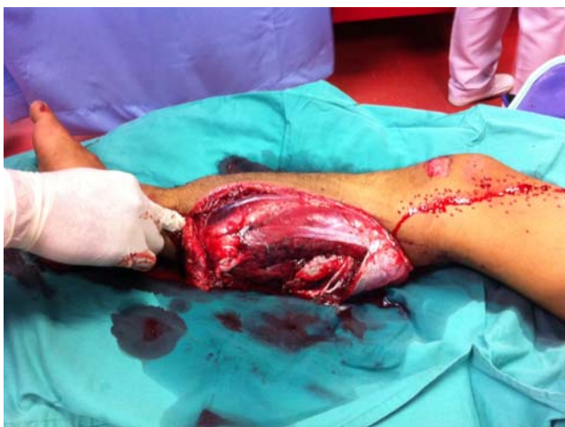
Figure 8: Grade IIIB open distal tibia/fibula fracture. The wound size measures > 10cm and soft tissue is severely damaged. However, there is no vascular involvement

Figures 8-11 illustrate the preoperative and postoperative sequence of management of an open tibia/fibula fracture.