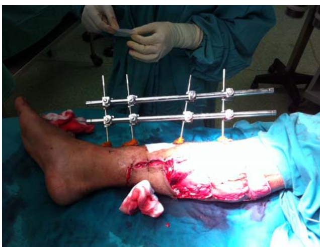
Figure 10: Post-operative application of biplanar external fixation at the fracture site