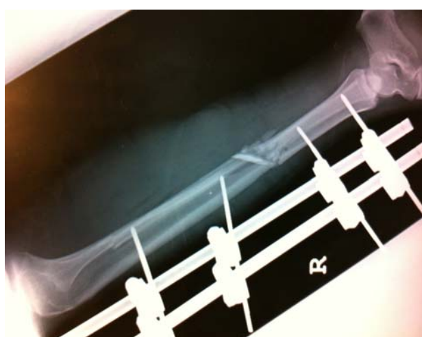
Figure 11: Lateral view of biplanar external fixation under radiological imaging