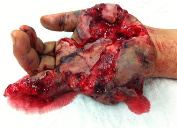
Figure 7: Crush injury caused by sugarcane grinder machine

Crush injury of the limbs can lead to crush syndrome or traumatic rhabdomyolysis ( Figure 7 ). A combination of muscle ischaemia and cell death releases myoglobin which can cause acute renal failure. As a result, elevated creatine kinase levels in these patients may precipitate disseminated intravascular coagulation (DIC) 10 .