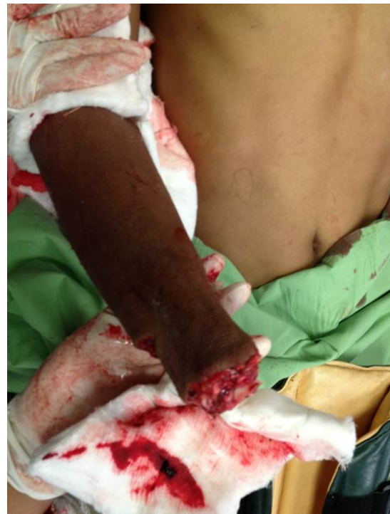
Figure 12: Amputated right hand after a 'parang' assault

The goal is to preserve the limb for reattachment. Therefore, delays in transportation should be avoided. The amputated part should be covered with saline moistened gauze and sealed in a clear plastic bag on a