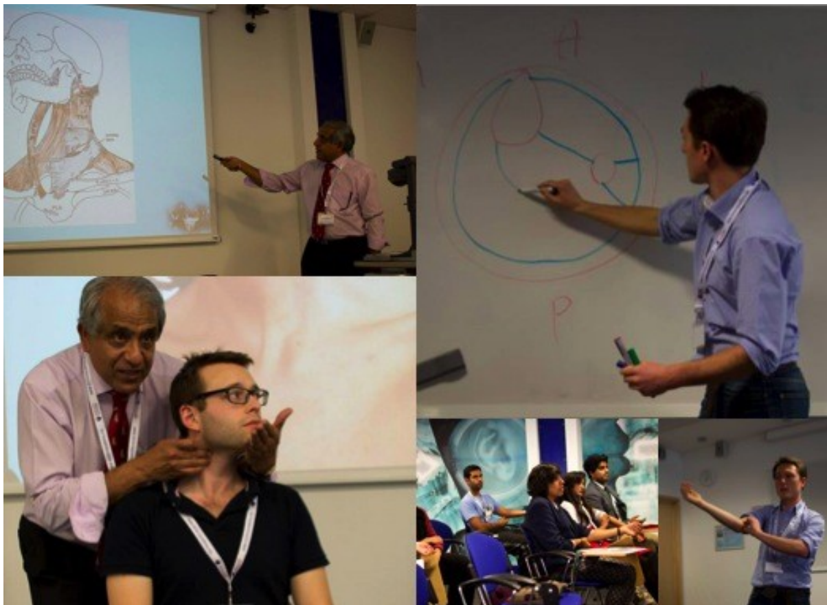
Figure 2: Afternoon anatomy workshops