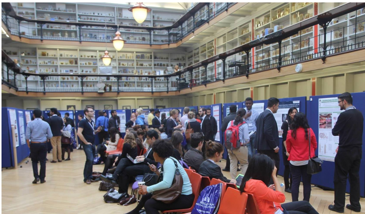
Figure 3: Poster competition

The conference had a total of 75 delegates from over eighteen UK medical schools, 59% were in clinical years of study, 9% doing an intercalated Bachelors of Science degree (BSc) and 32% in preclinical studies. Many of the attending delegates had or were undertaking a BSc in anatomy-related subjects. During the conference, delegates were asked to complete a questionnaire exploring students' motivation to attend such conferences and