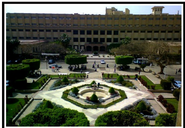
Figure 2: Kasr-Al-Ainy Medical School.

Matriculating into medical school is no simple matter. In Egyptian culture, a doctor is a highly esteemed, respected and important figure in society and as enumerated