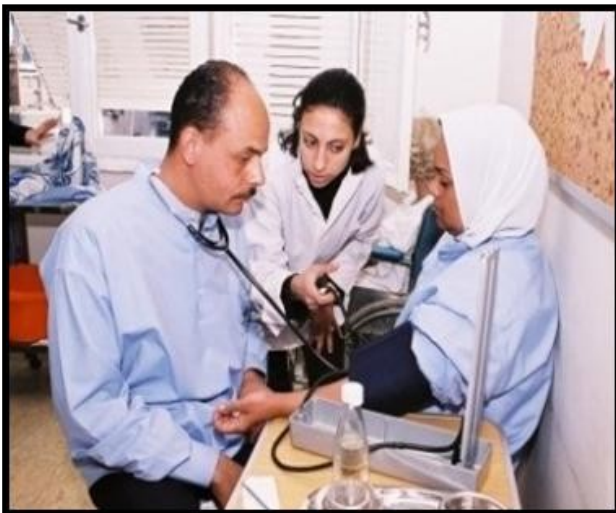
Figure 4: Primary health care unit in Egypt.

comprised. It includes primary health care represented by family health units and centres on the one hand and district, general and teaching hospitals on the other hand. A family health unit is a place that provides health care for 'the whole family' as is evident by its name. Within it, details about all members of each family served should be carefully recorded; history of illnesses, investigations, immunizations received... etc. Simple maladies should be diagnosed and treated there; patients are otherwise referred elsewhere with more specialized equipment and personnel. Each family health unit should be equipped to serve around 500-3,000 families in rural areas and 5,000 – 10,000 families in urban areas. 3