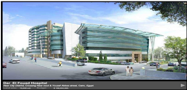
Figure 5: Dar-El-Foad private hospital.